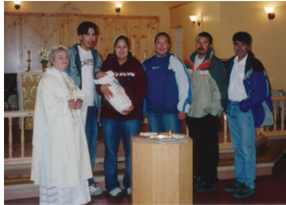
A baptism in St. Barnabas, Waswanipi, QC in the Diocese of Moosonee

—from the Council of the North Policy Handbook