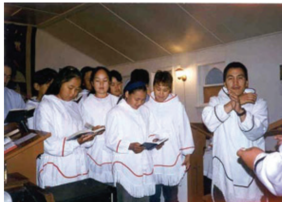
A youth choir at St. Francis, Arviat, Nunavut

—from the Council of the North Policy Handbook