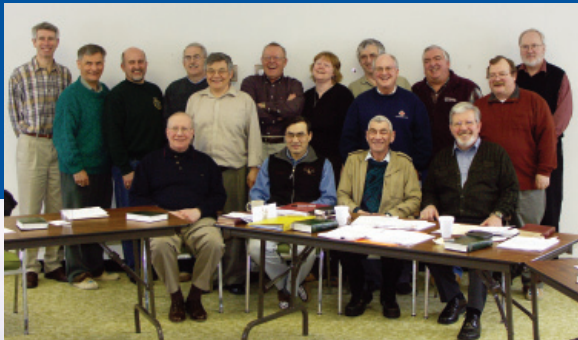
Members of the Council of the North, April, 2005